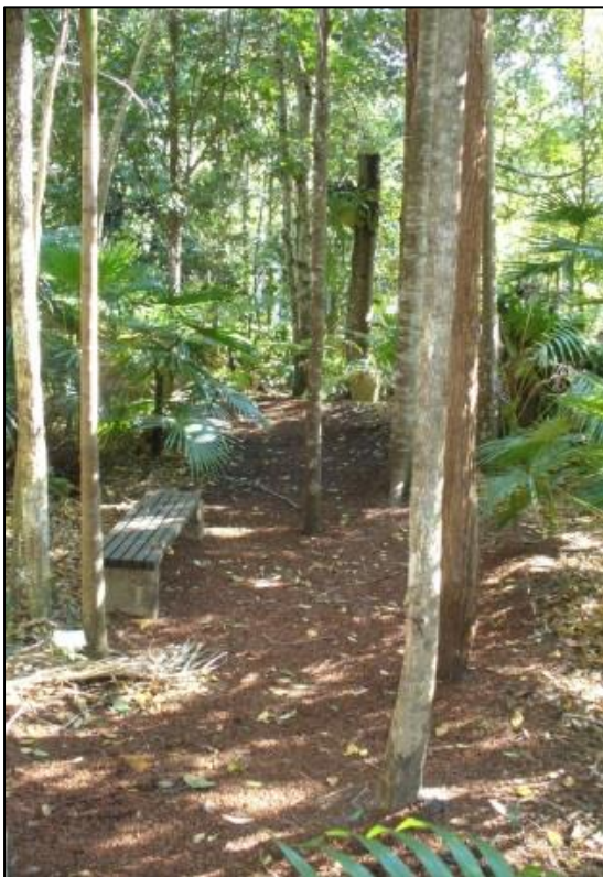
4. Maroochy Regional Bushland Botanic Gardens – Tanawah

Biodiversity Sunshine Coast Council Community Partnerships